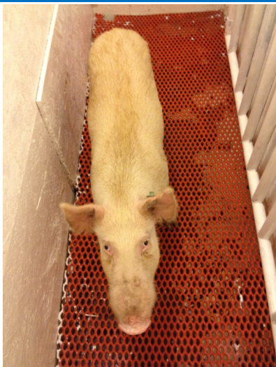
Hanford™ Miniature Swine at CARE Research

CARE Research is currently conducting a respiratory project to evaluate a novel device to treat emphysema. The study is being conducted specifically on Hanford™ Miniature Swine, a fully pedigreed, purpose-bred line of pigs. CARE's expertise with medical devices in multi-species projects is crucial—the pre-clinical data collected will determine whether the device can be marketed in the US and also to broaden it's application for indications for use both in the US as well as in Europe.